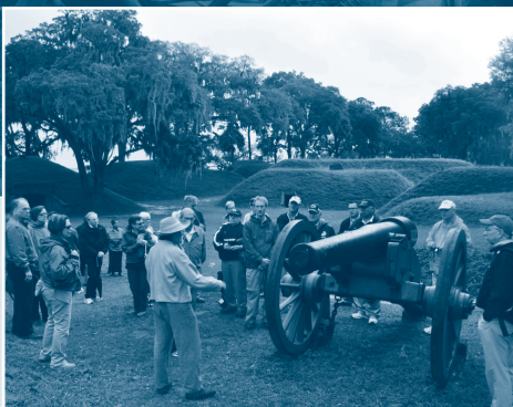
Executive tour attendees listen to a presentation at Fort McAllister